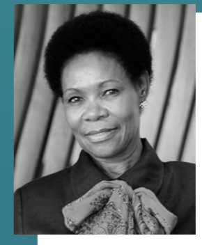
Retired Constitutional Court Justice Yvonne Mokgoro