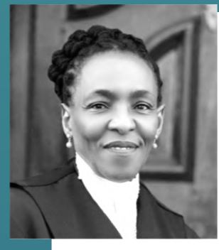
Deputy Chief Justice Mandisa Maya